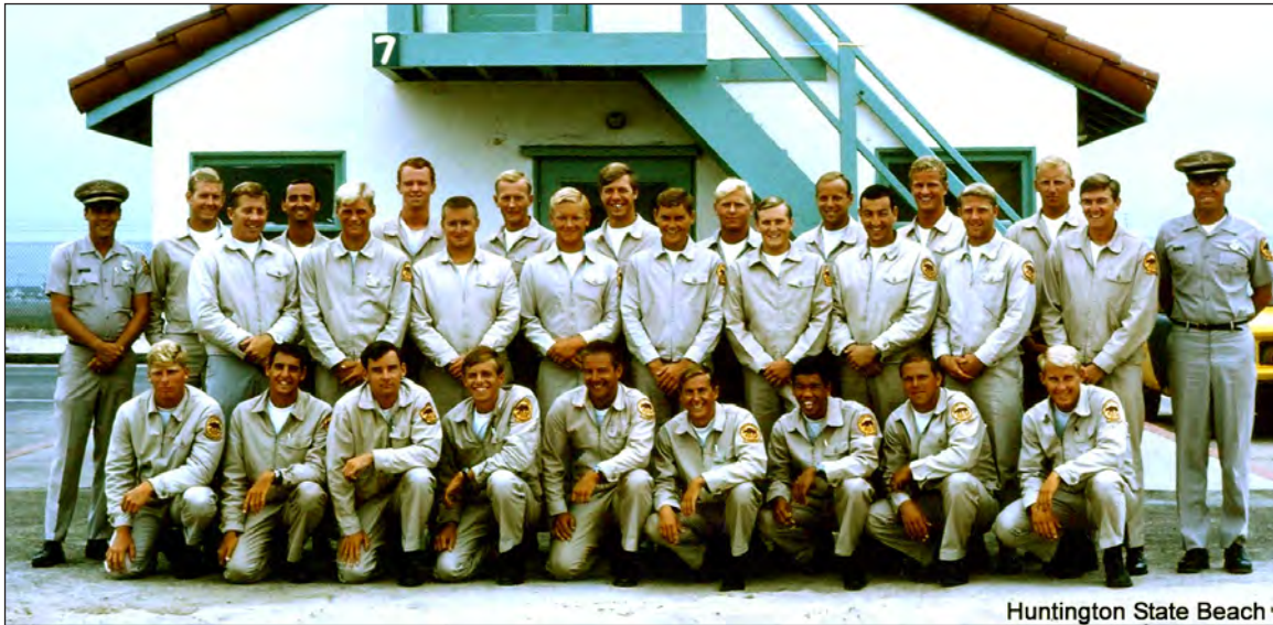
Huntington State Beach Lifeguard staff in 1967. Still wearing khaki uniforms but sporting the relatively new brown bear round patch with a Lifeguard rocker, adopted in 1964.