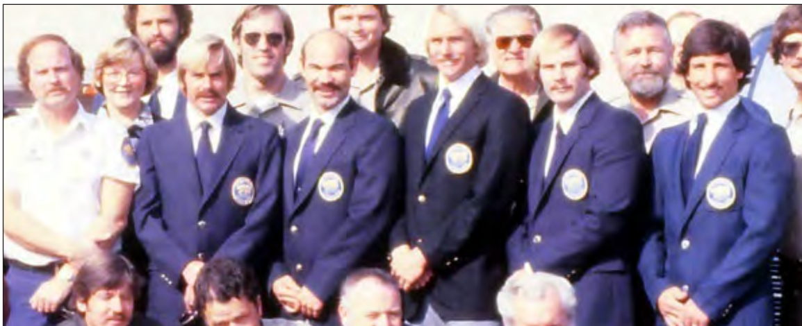
Orange Coast lifeguards wearing the first dress uniform, consisting of blazer, white shirt, silver pants, and a metal thread bullion patch, photo about 1981.