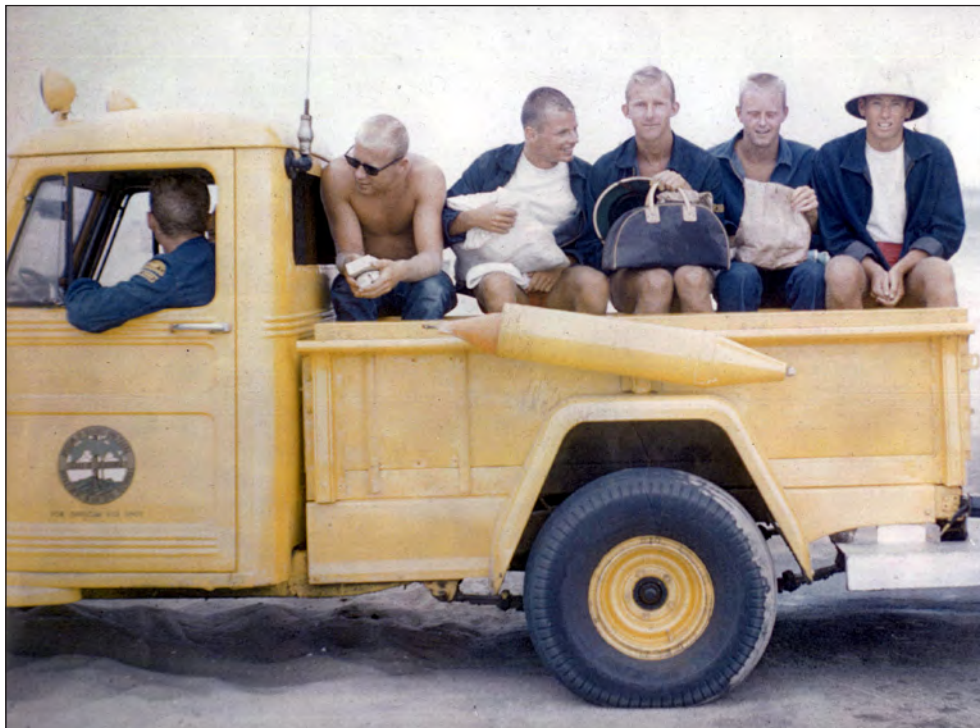
1960s at Huntington Beach. Seasonal guards are wearing blue denim jackets and have pith-style helmets, authorize starting in 1958. Note the Beaches and Parks door decal authorized starting in the 1950s.