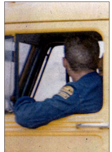
In this close up of the driver and you can just make out the lifeguard tab patch below the Beaches and Parks patch.