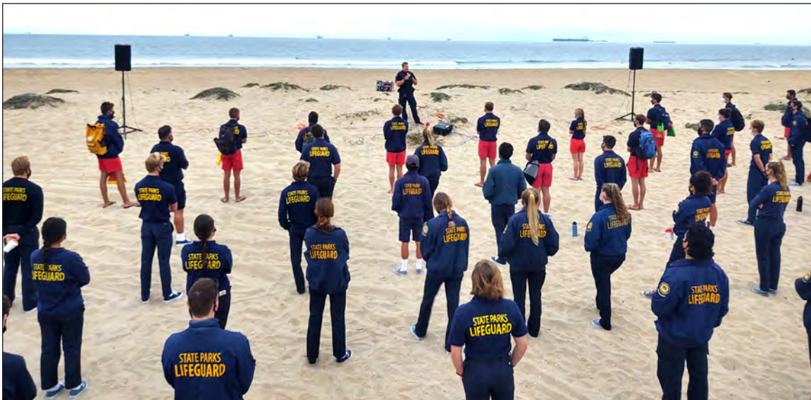
The Huntington State Beach lifeguard staff wearing dark blue shirts and jackets lettered “State Parks Lifeguard”.