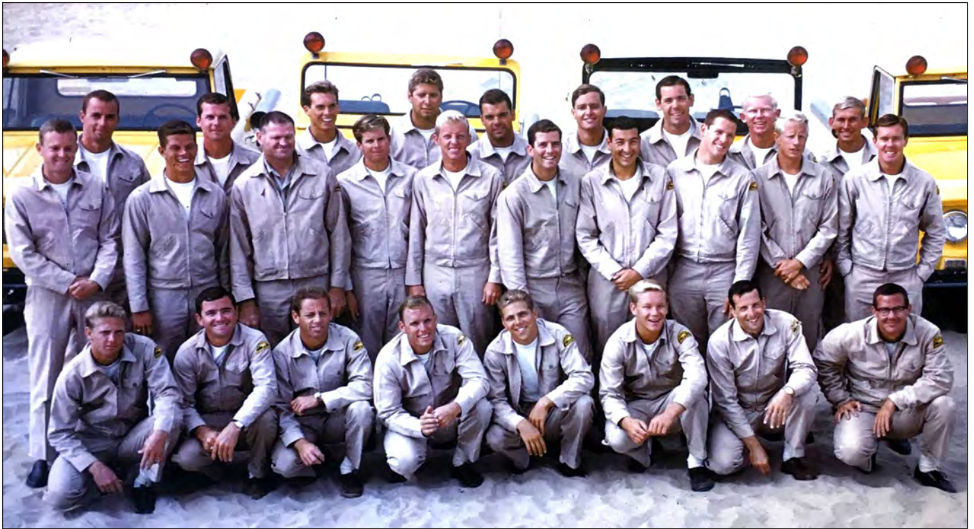
Huntington State Beach lifeguard staff in 1964, wearing khaki uniforms and Beaches and Parks patches.