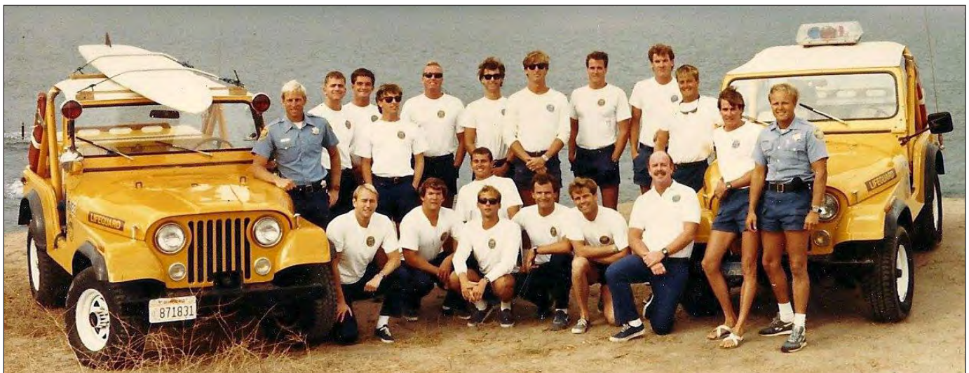
The Crystal Cove lifeguard staff in 1987, wearing light blue shirts for permanent lifeguards and white T-shirts, dark blue pants and blue shorts all around.