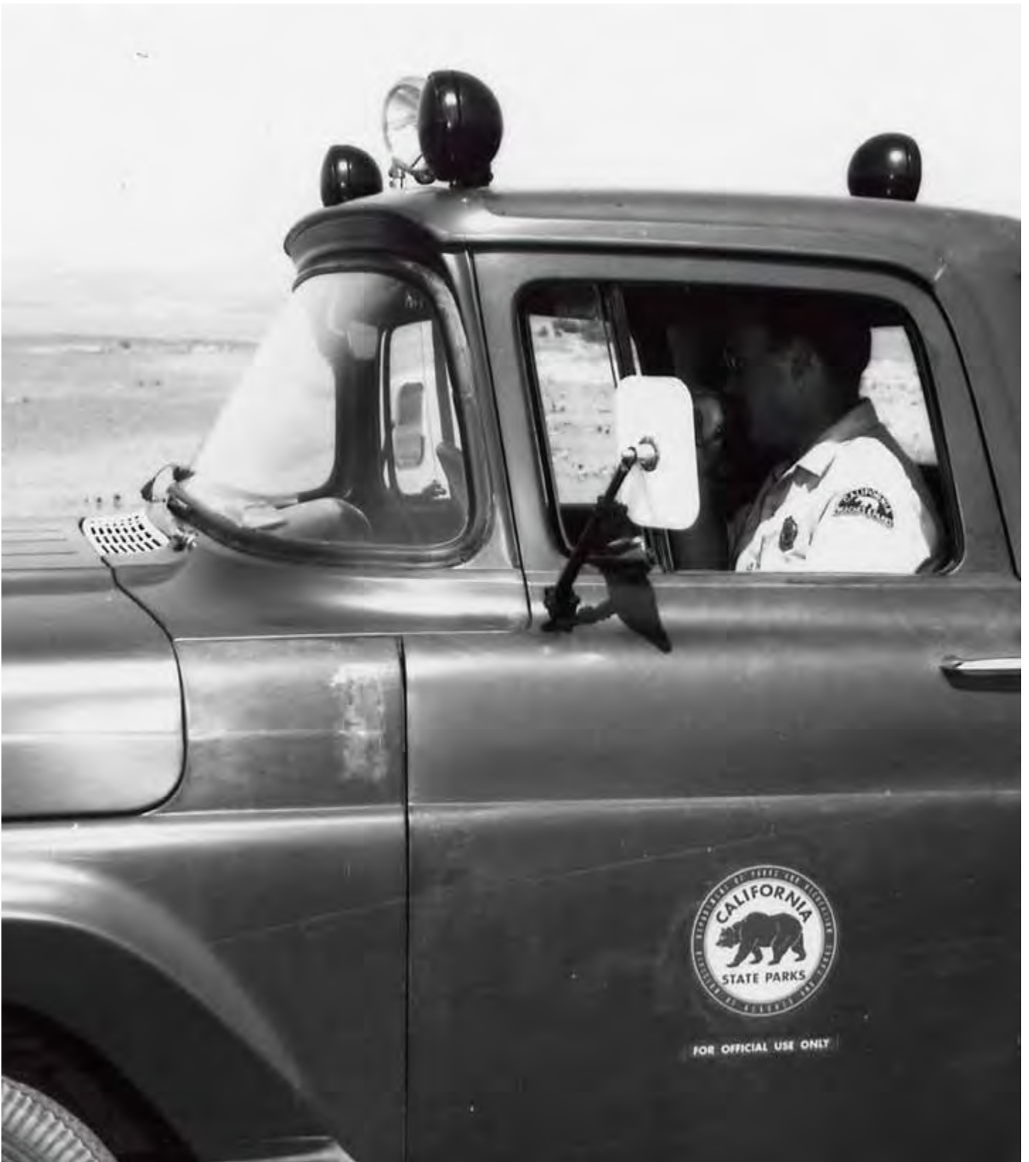
An unidentified ranger driving pickup with the 1961 decal at Folsom Lake State Recreation Area.