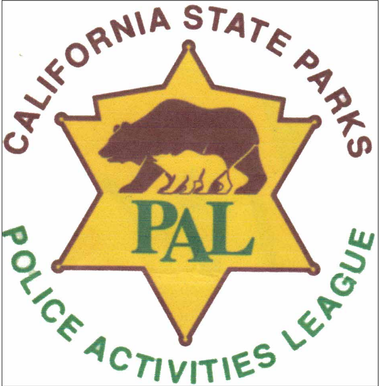
Current California State Parks Police Activities League decal.