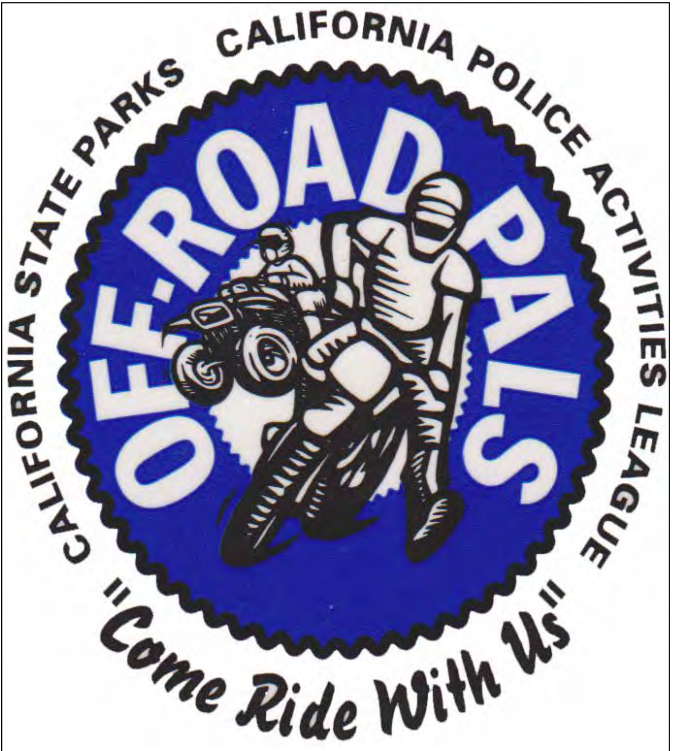
Current off-road Police Activities League decal.