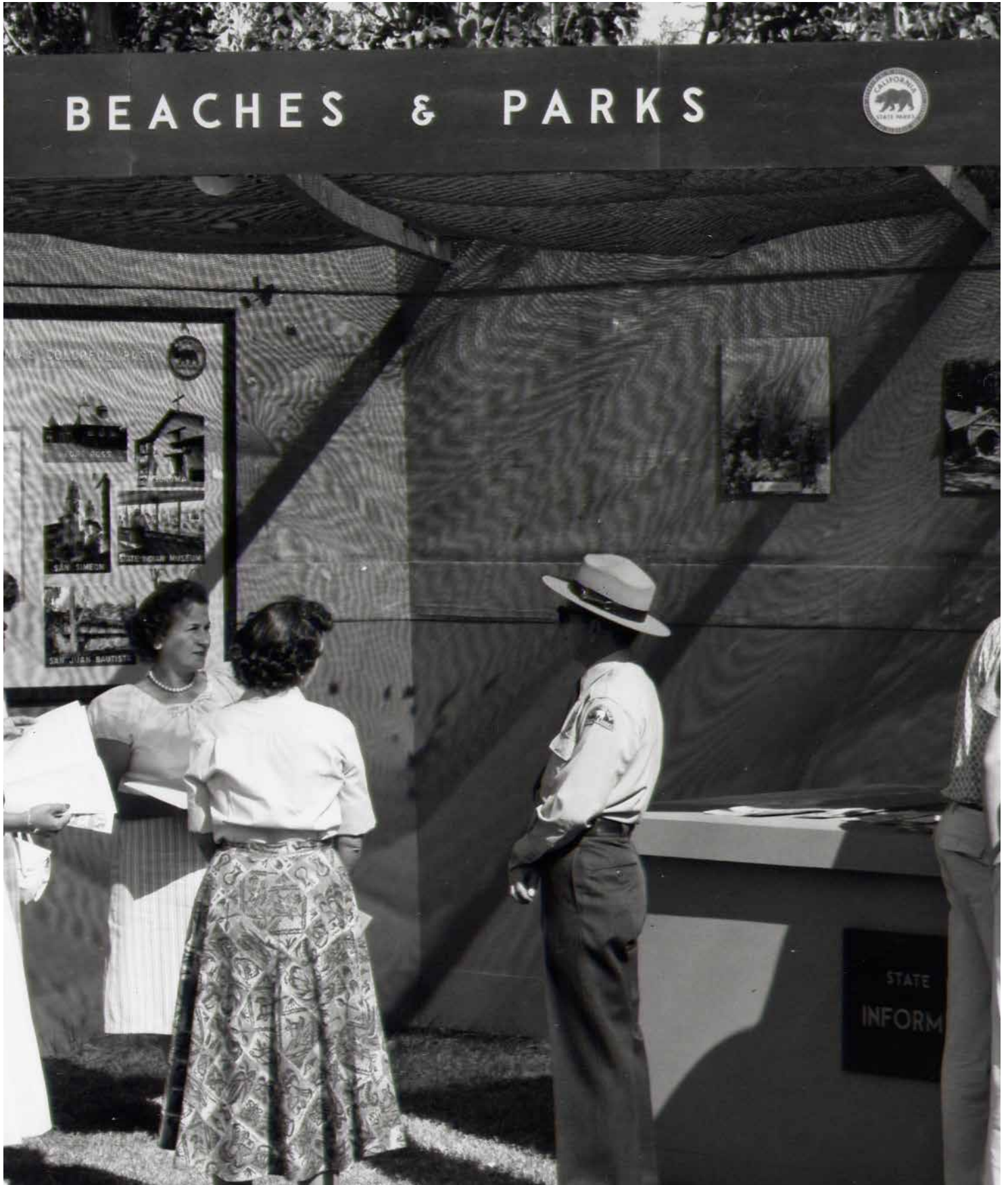
Department of Natural Resources, Division of Beaches and Parks decal - 1959-1961