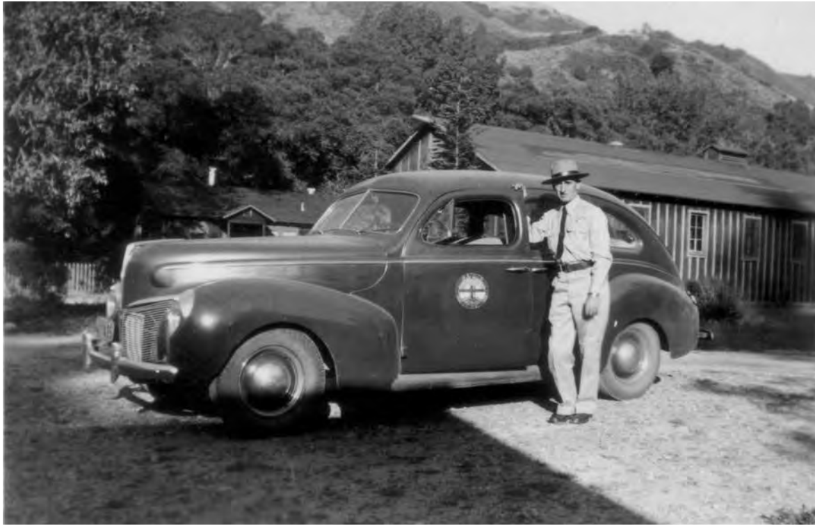
Ranger Al Whittington at Big Sur about 1940