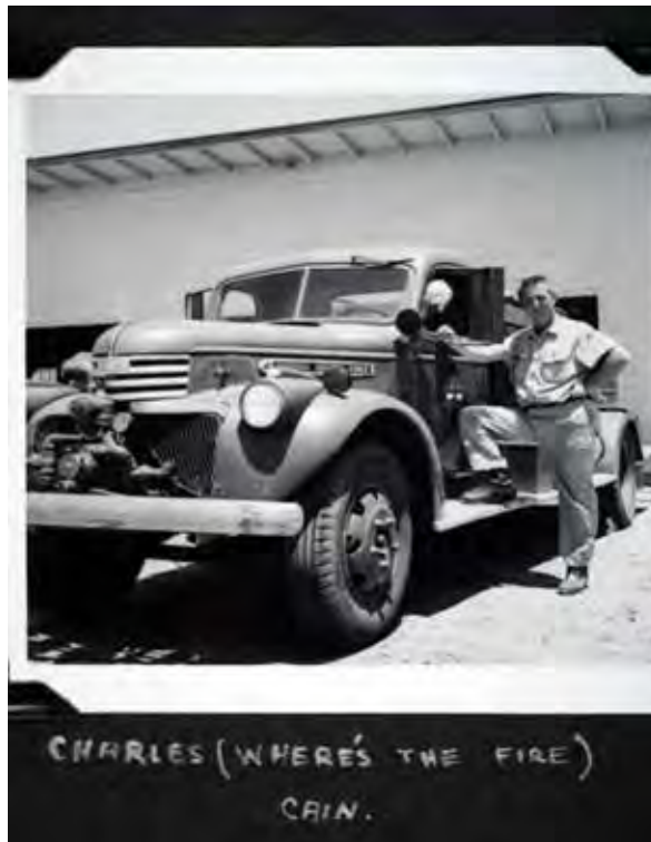
Folsom Lake State Recreation Area 1950's