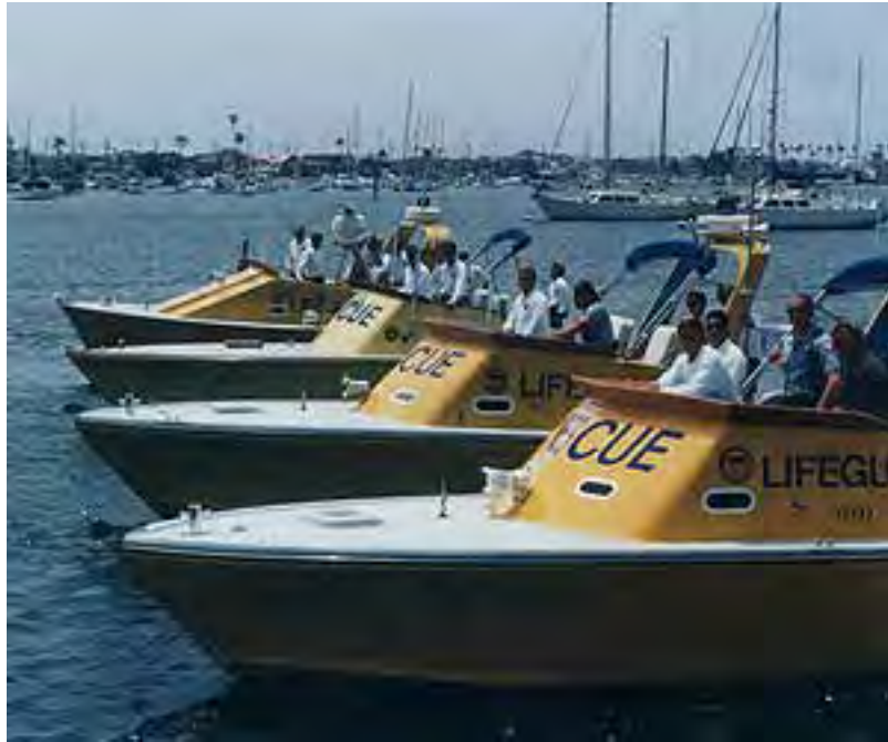
Lifeguard patrol boats.