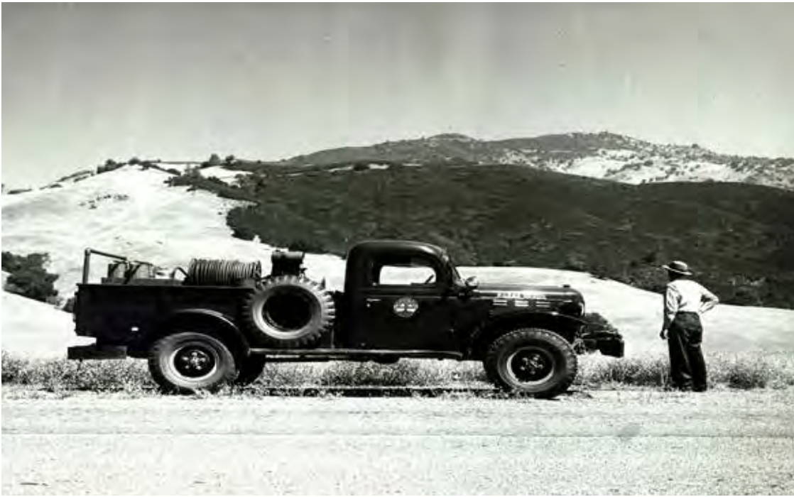
Mount Diablo State Park