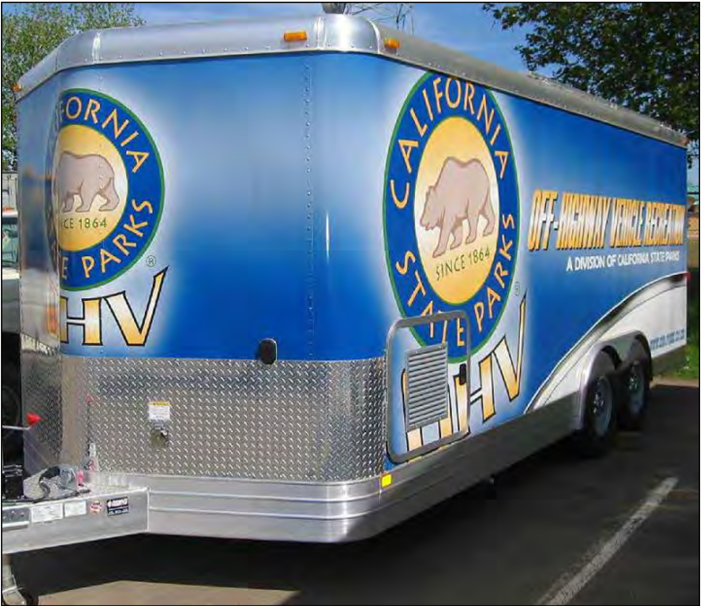
Current Decal in use on Off-Highway Motor Vehicle Recreation Division trailer.