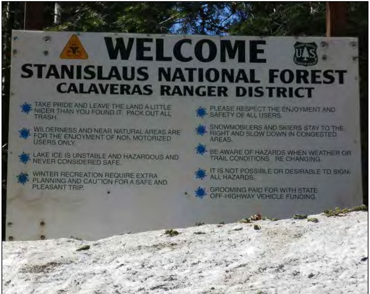
California OHV Funds at Work decal in use on Stanislaus National Forest sign at Lake Alpine- Ebbetts Pass, California.