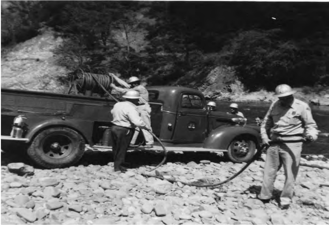
Fire Crew at Richardson Grove State Park in 1961