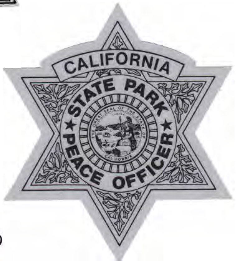
Color decal of State Park Ranger Badge 2009 - Present.