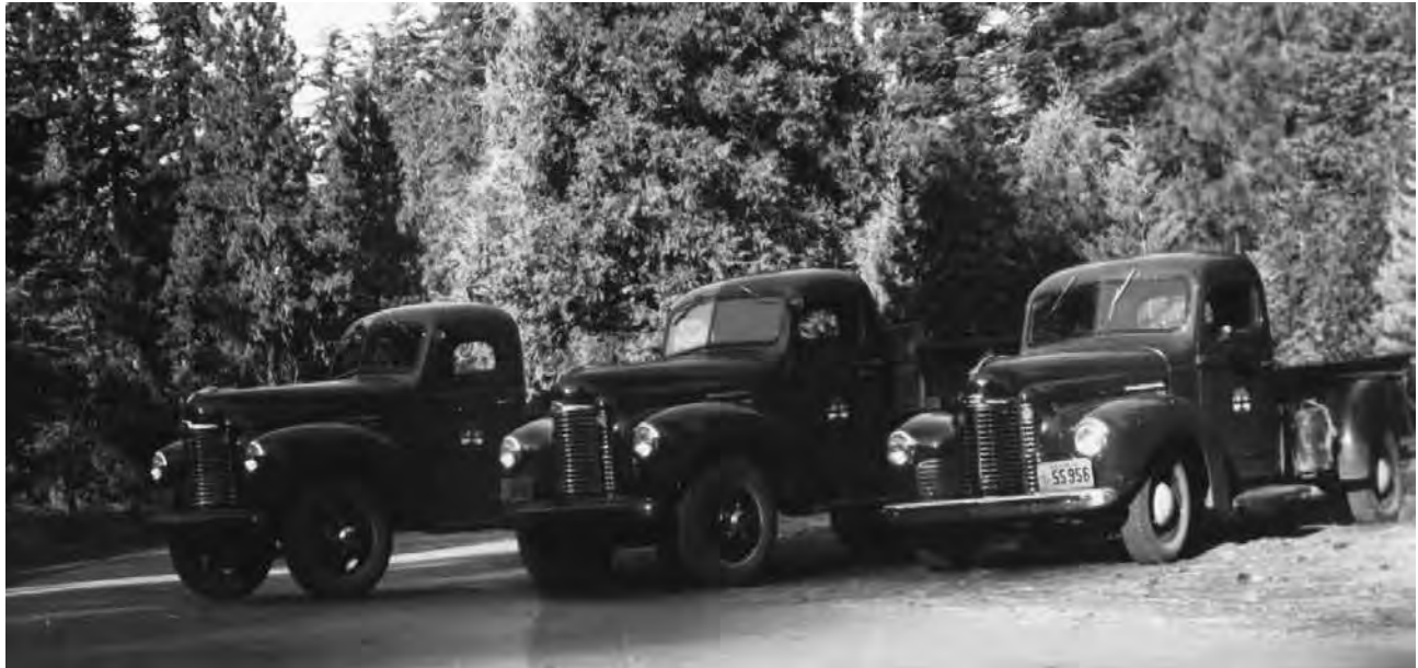
Patrol trucks at Calaveras Big Trees State Park in 1947