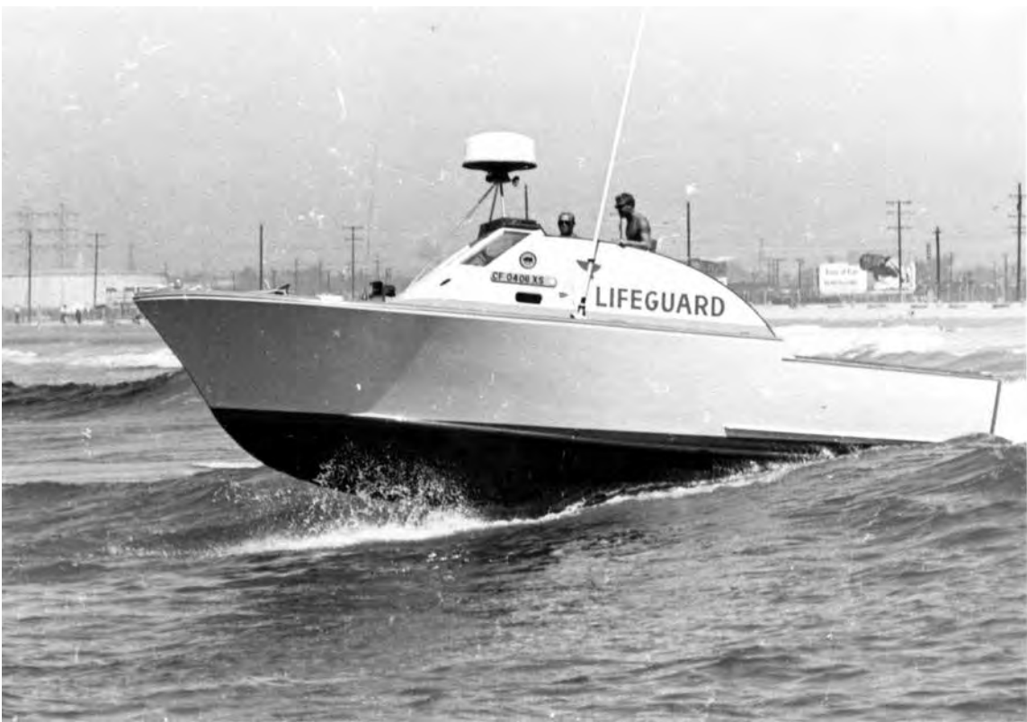
Lifeguard patrol boat.