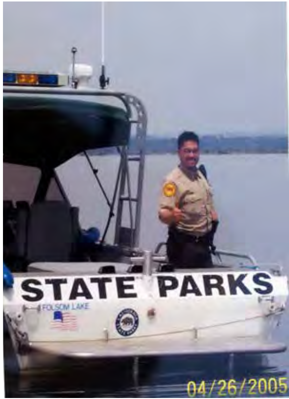
Folsom Lake SRA