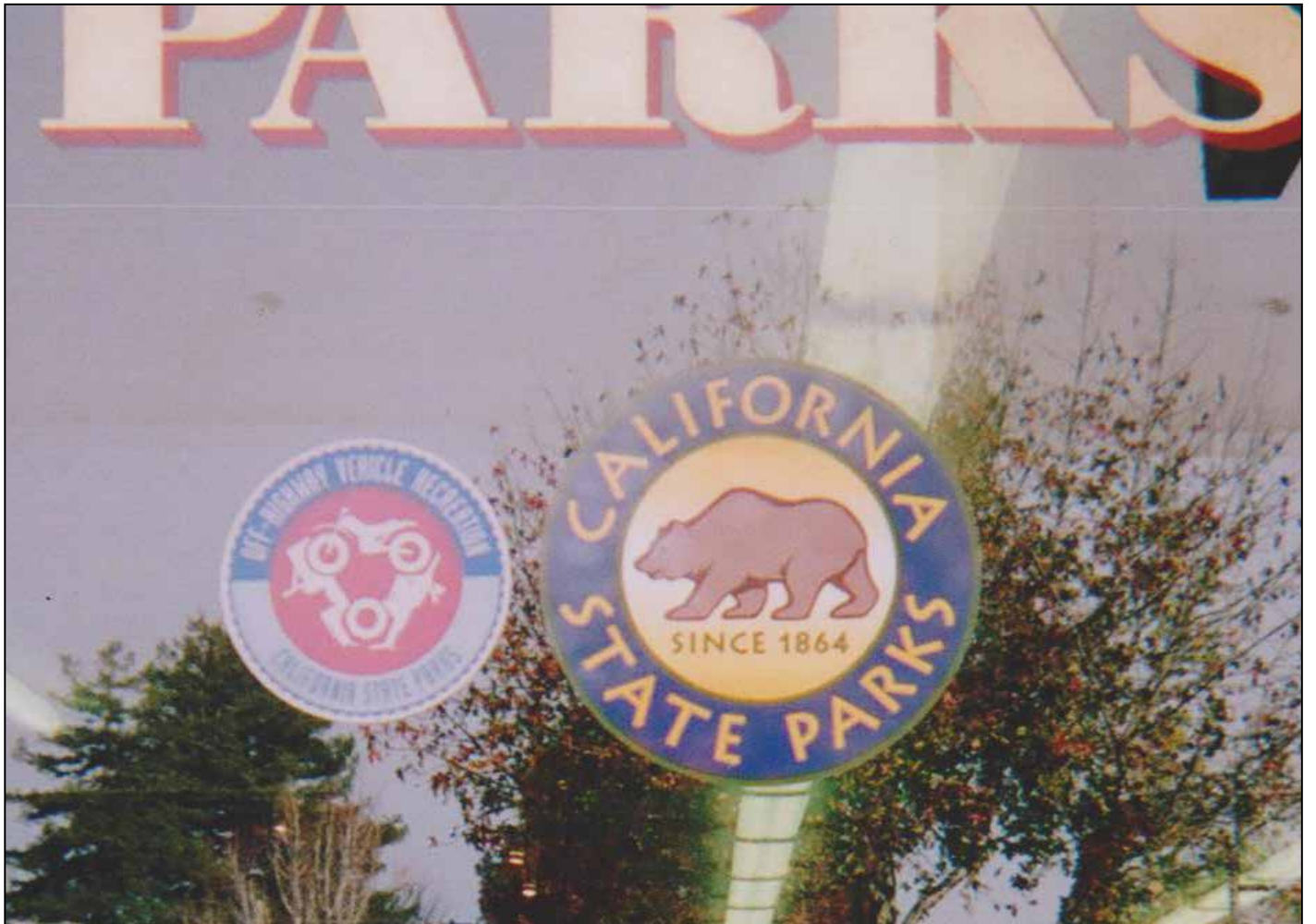
Off-Highway Motor Vehicle Division decal and current California State Parks decal in use at uniform store in Santa Cruz, California.