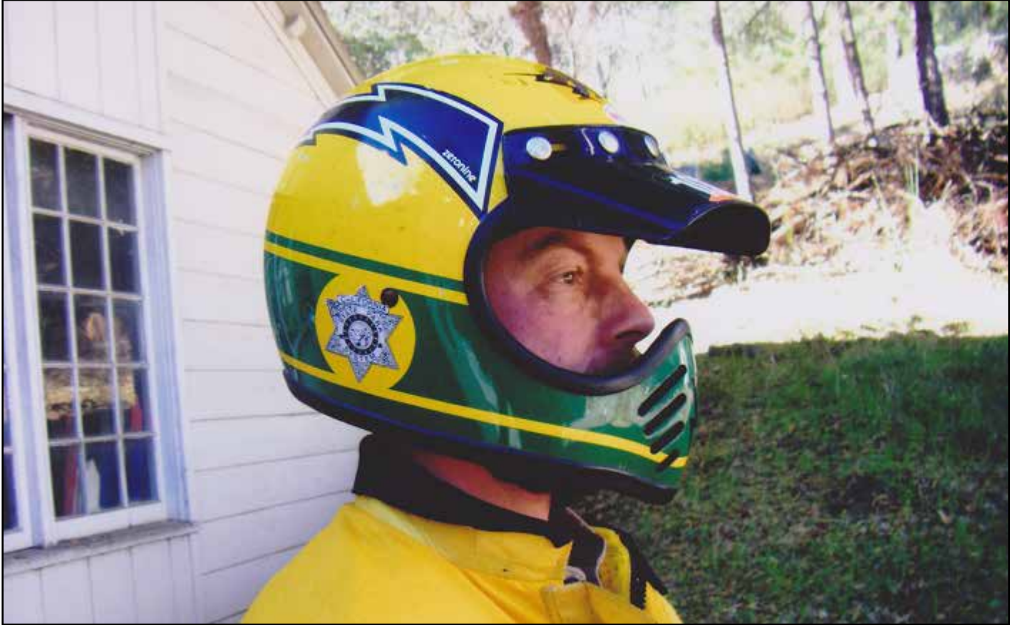
Badge Decal in use on off-highway vehicle helmet.