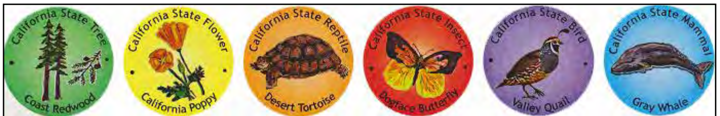
Examples of Junior Ranger, Junior Lifeguard, May is State Parks Month, and Litter Getter Stickers.