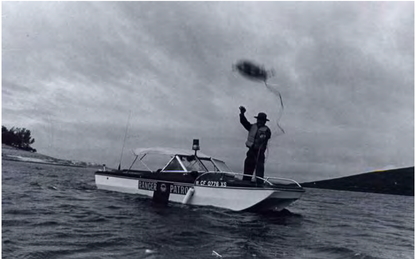
1970's Boat Patrol