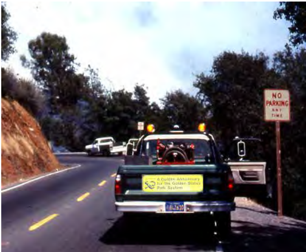
Sign commemorating 1928 - 1978 anniversary