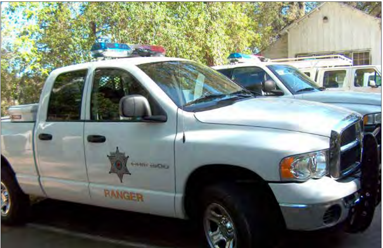
Star Prototype at Folsom Lake State Recreation Area.