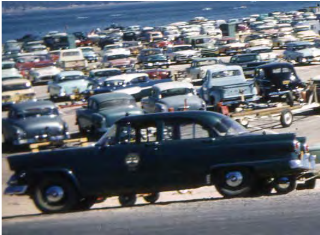
Folsom Lake State Recreation Area in late 1950's