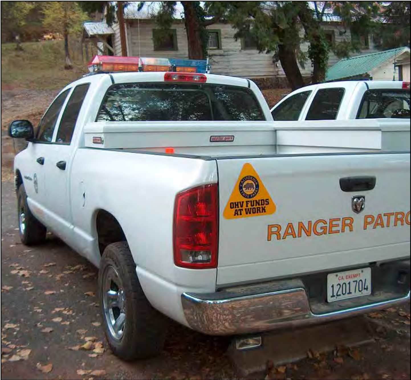
Current OHV Funds at Work decal in use.