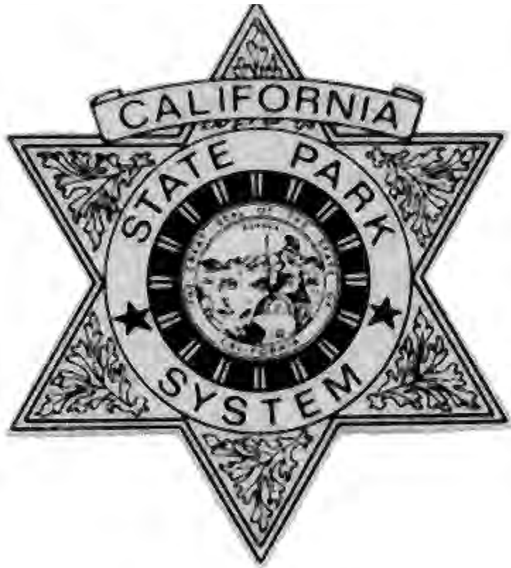
Decal of State Park Peace Officer Badge from the early 1980's.