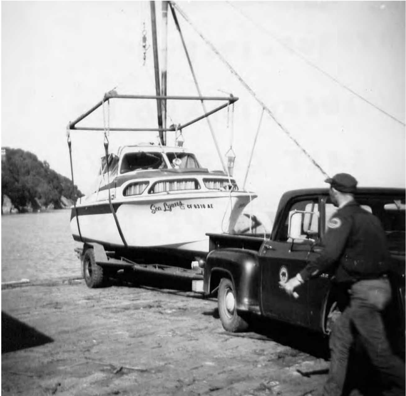
Patrol Boat at Folsom Lake State Recreation Area.