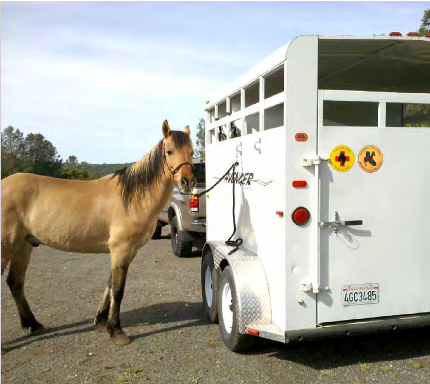
Mounted Assistance Unit decal on horse trailer. Also notice the Folsom Lake Mounted Assistance decal on trailer.