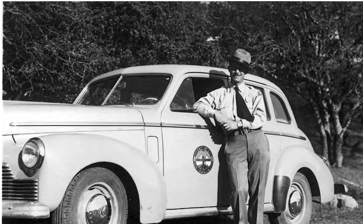
Mount Diablo State Park