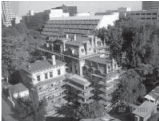
Stanford Mansion, during rehabilitation, in the Sacramento cityscape