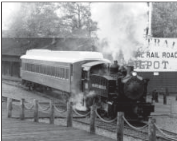
The California State Railroad Museum explains the history and development of the western

Old Sacramento was the terminus for many other things. The B.F. Hastings building was the Western terminus of the Pony Express and later the transcontinental telegraph. The recreated 1876 Central Pacific Passenger Station is located at the terminus of the first transcontinental railroad. And didn't that open up California to the world!