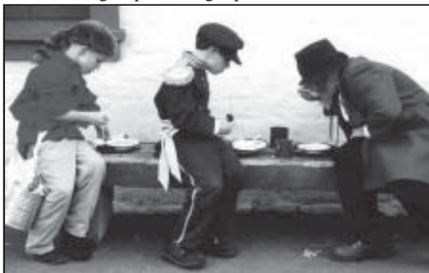
Working for Captain Sutter is a good way to work up an appetite in the Environmental Living Program at Sutter's Fort.

The ELP is just one of many special programs offered at Sutter's Fort. Visitors have over 20 opportunities to engage in historical interpretation with LIVE (most of them) docents dressed in period clothing. In addition, the visitor can interact with up to six seasonal interpreters and