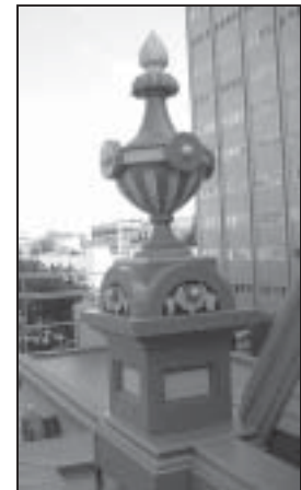
A restored roof spire atop the Stanford Mansion with the Resources Building (home to DPR Headquarters) in the background

basis for pre-restoration tours while plans to restore the home began. Those plans were halted when the state experienced a recession in the early 1990's. It soon became evident that there would not be sufficient state funds available to accomplish this project, and that's when the idea of a public-private partnership was pursued. In 1991, the Leland Stanford Mansion Foundation was incorporated and fundraising efforts began. This public-private partnership has through determination, perseverance, and commitment, continued to strive toward the goal of reviving the mansion for public service for over twelve years, through two administrations and several changes in Department leadership.