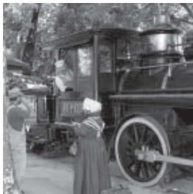
Gold Rush Days volunteers in Old Sacramento

The final phase of the California State Railroad Museum, the Railroad Technology Museum (RTM) , will be located within the former Southern Pacific Railroad Sacramento Shops and Railyard, using buildings donated by the Union Pacific Railroad (now the owner of the former South-