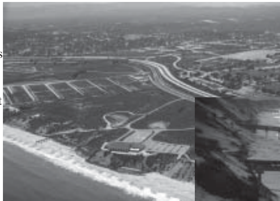
Fort Ord outfalls >>

--In 1997 State Parks completed a $75,000 EEM Grant funded project