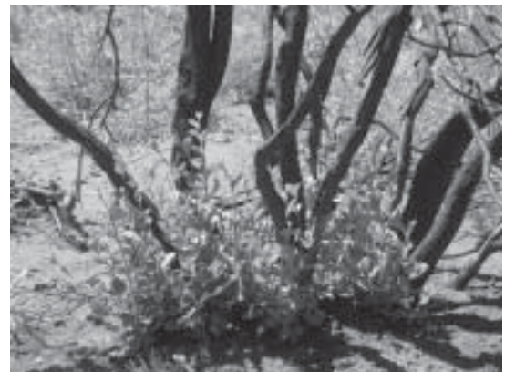
Tender green shoots stand in sharp contrast to the blackened skeletons. Life has undeniably returned to Cuyamaca.

When will the park and forest be back to normal? Expert opinions differ, and it's not really fair to call the pre-fire conditions normal. There will be changes, there always have been. In some parts of the forest, oaks may replace pines. Natural processes are very much at work, it will be exciting to watch and see. In fact we're seeing amazing regrowth already. We are confident that Cuyamaca Rancho State Park will heal.