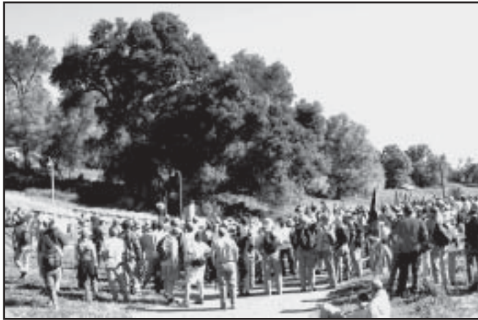
Resounding cheers filled the air as Director Coleman announced the re-opening of Cuyamaca Rancho State Park

Although many facilities are still closed and may remain closed for some time, the Green Valley Campground and a large portion of the trail system have re-opened. The forest is healing too. Oak trees are covered with tender new leaves and the shrubs are sending up strong new