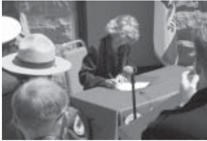
Interior Secretary Gale Norton transferred the Point Sur Lighthouse to State Parks in April, 2004