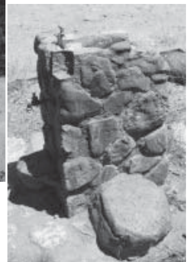
A CCC era drinking fountain

The seventy-one sites of Main Camp that are nestled in and out of the redwoods and skirt along the Big Sur River were by no means placed there by accident. Sawmill Flat, as it was once called, was the largest and flattest redwood grove in the area, lending itself perfectly to camping sites. Unfortunately, decades of campers, cyclists, backpackers and day users have taken their toll on our majestic redwood groves. The once characteristically spongy soil around the base of the redwoods now feels