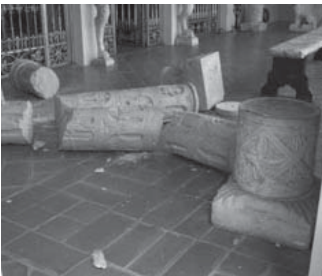
Artifacts damaged range in age from a 1 st century B.C. marble Roman vase to 19 th century carved Roman columns.

Built on bedrock, the concrete, reinforced structure, was designed to not only withstand the effects of nature and protect its occupants, but also the unsurpassed collection of