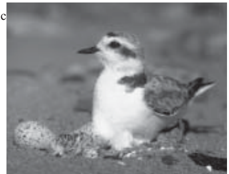
Western snowy plover on nest