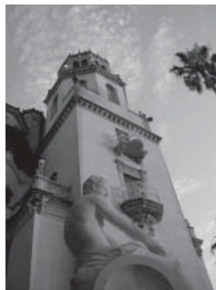
The Castle itself had no adverse effects from the earthquake.

Correspondence from William Randolph Hearst to Julia Morgan in 1927 states, "...from here forward, I would like to dispose of the less desirable items in the collection and collect the best that I possibly can for future generations to enjoy...". Thanks to Hearst's vision and Ms. Morgan's unprecedented abilities, Hearst Castle® stands today, without structural damage and artifacts that are repairable, to carry out WRH's vision.