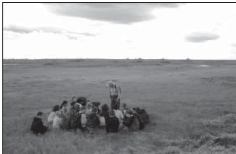
A school group at Great Valley Grasslands State Park

The Department's Central Valley Brochure can be easily viewed through http://www.parks.ca.gov/pages/21491/files/cvreport.pdf .