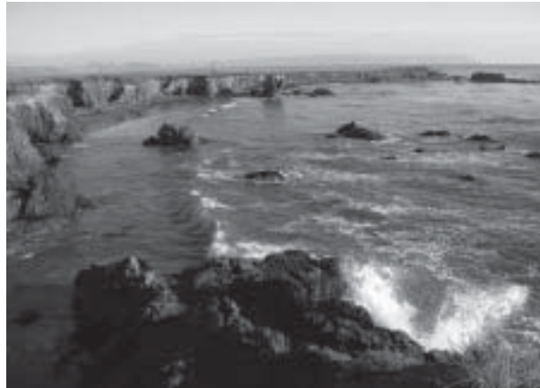
Estero Bluffs, not yet classified

lanes in Morro Bay State Park with partial funding from the San Luis Obispo Council of Governments and the development of new acquisitions along this outstanding section of the California coast.