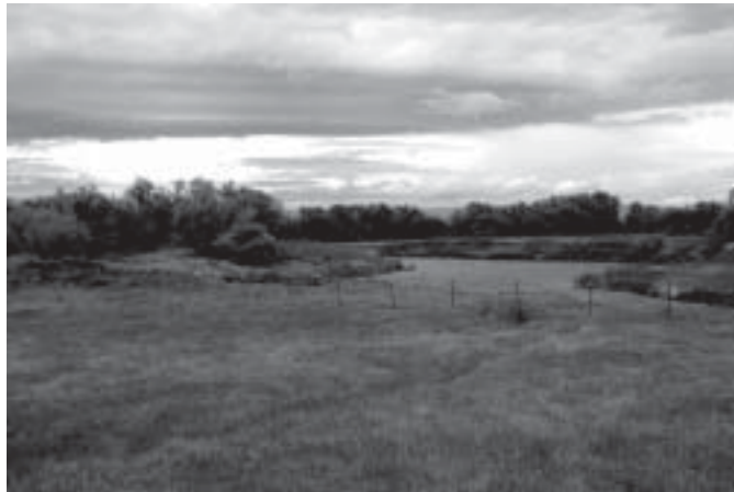
Great Valley Grasslands SP

c. Acquire lands that protect significant natural resources once