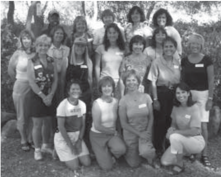
Is this the biggest gathering of "first-generation" (and a few recent) women rangers ever?