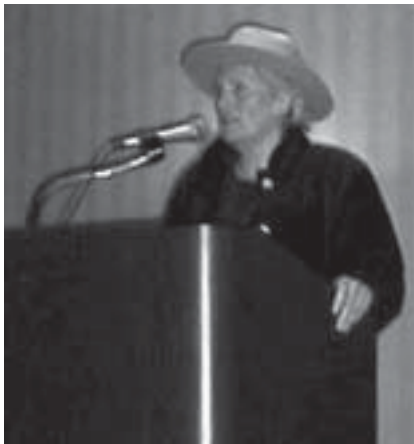
^^ Andrea Mead Lawrence