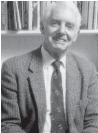
^^ David Brower