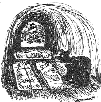
"The park gets more crowded every year."