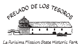
La Purisima Mission State Historic Park