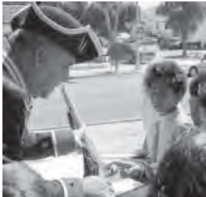
A soldado, establishing rapport, shows his musket to young visitors