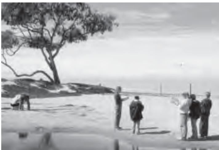
Sixth graders learn about coastal dunes at Carpinteria State Beach

district with the idea of involving students in the project. The sand berm project lent itself well as a focus for the sixth grade because their curriculum includes both geology and plants. Students worked with park employees to plant native seeds on the bare sand. The program went so well that the next year the school district selected it for their Service Learning Program. Now, each year, students in the sixth grade class, all 200 of them, come to the park and work in the restoration area. They plant seeds, germinate plants, weed, and maintain a protective fence that the original group of sixth graders installed.