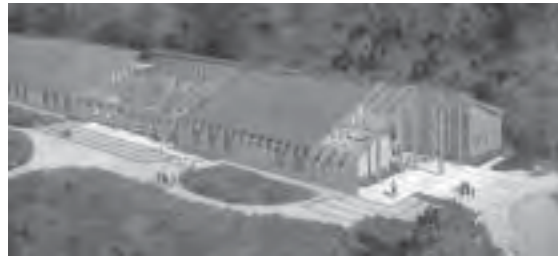
Artist's drawing of visitor center

It all paid off in 2002, when the Department allocated $3,000,000 from Proposition 12 to fund the design and construction of the new visitor center. The Department hired the architectural design firm BSA to design the facility. Prelado contracted exhibit designer Daniel Quan to work with the design team to ensure the interpretive designs would be compatible with the building and the landscaping. The final design called for a complex of four buildings giving the illusion of one large Civilian Conservation Corps's barracks building, and relocation of the parking lot. The four buildings include an exhibit building, a conference/multi-media and gift shop building, a multi-purpose building, and a library/archives building.