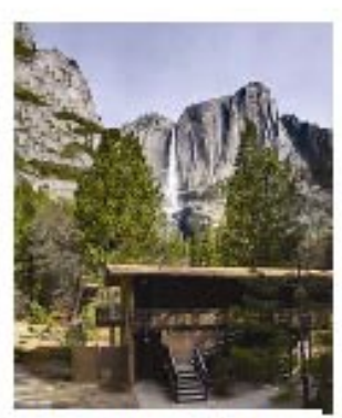
Yosemite Lodge at the Falls

Conference Size: The conference is limited to 175 registered attendees and room types as above. So reserve your room and make your conference registration now!