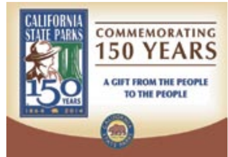
The 150th Banners which will be displayed in every park unit.