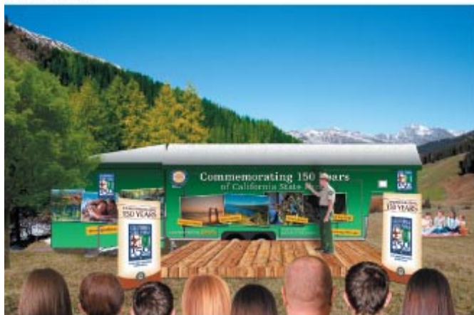
CA STATE PARKS TRAILER WRAP SPONSOR: CABELA'S