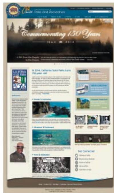
The front page of new 150th website.