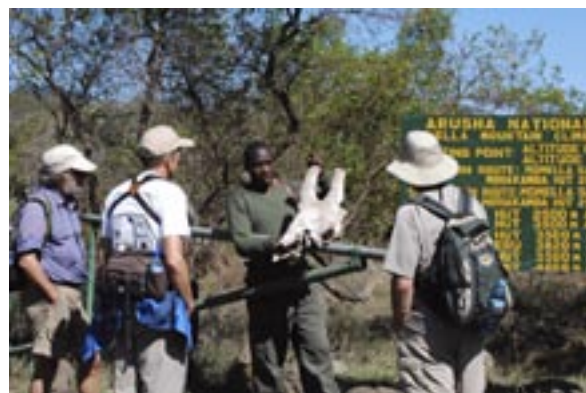
ON SAFARI : Tanzanian Rangers carry rifles on walking tours to protect visitors from the wildlife, mainly Cape Buffalo. Above, a giraffe skull as prop.