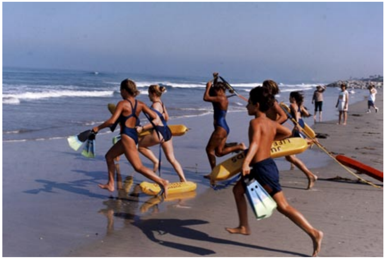
Boots on the Ground in San Diego, March 2-4