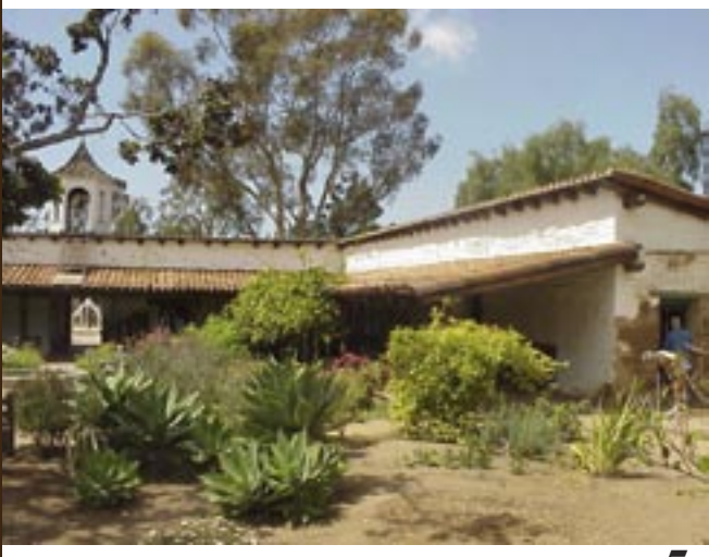
CSPRA Wave , Winter 2015 5